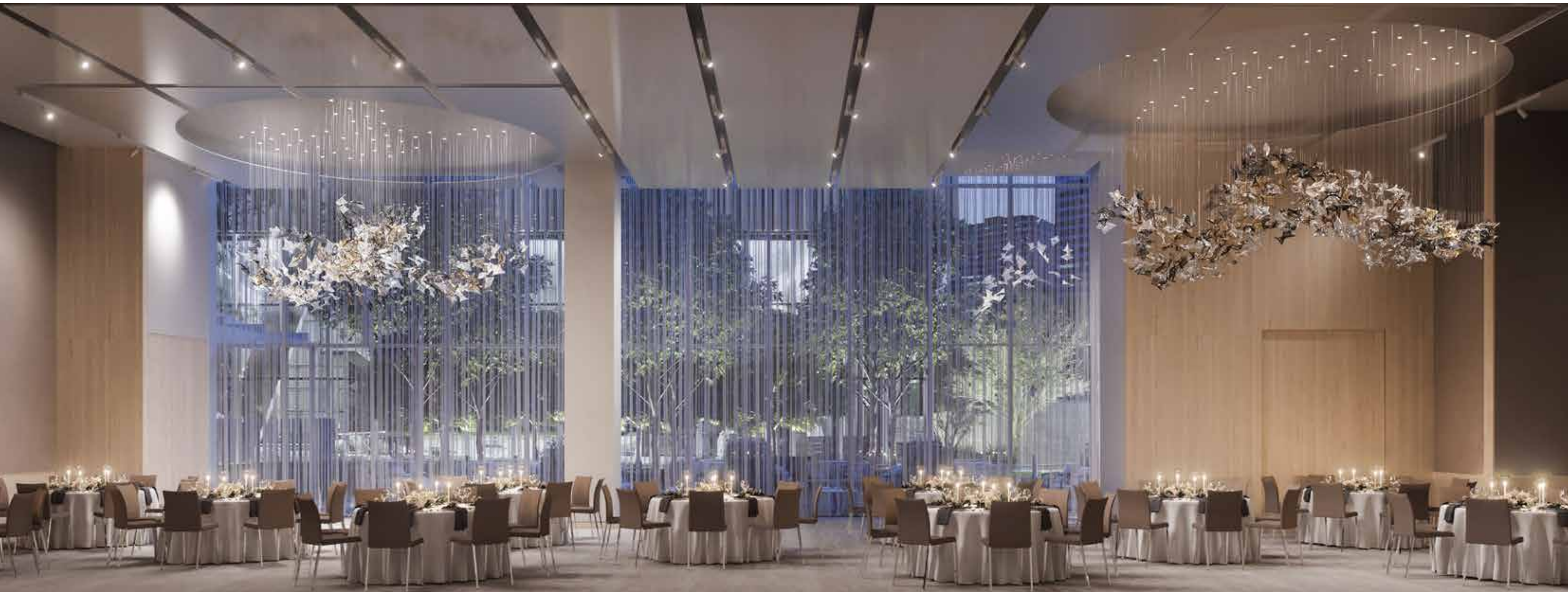
Grand HALL Ballroom.

HALL Arts Hotel will offer 6,000 square feet of sophisticated meeting and event space, which includes two multi-purpose salon spaces, the HALL Arts Boardroom and a one-of-kind 2,500 square foot ballroom, equipped with advanced technology. The only