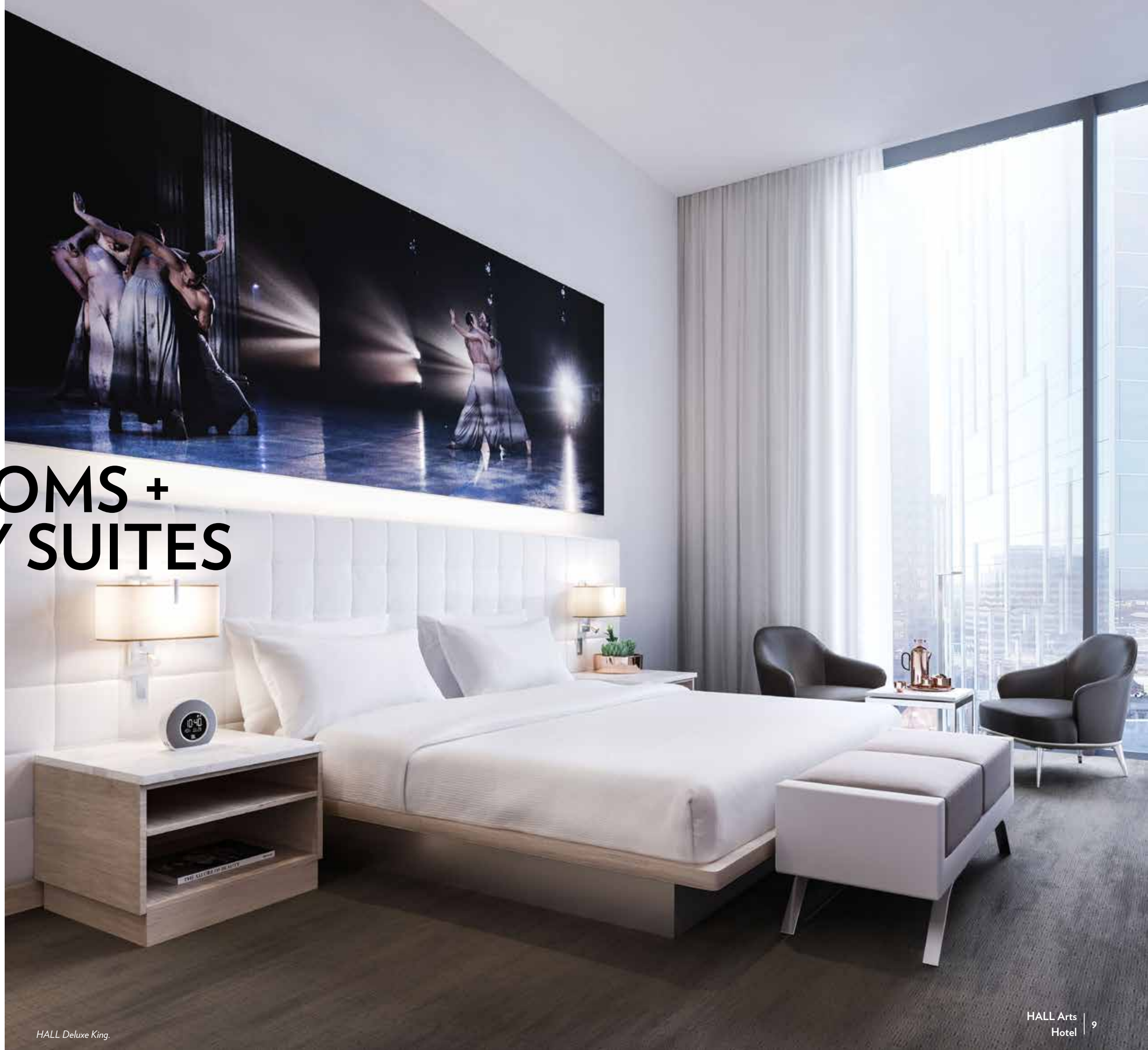
HALL Deluxe King.