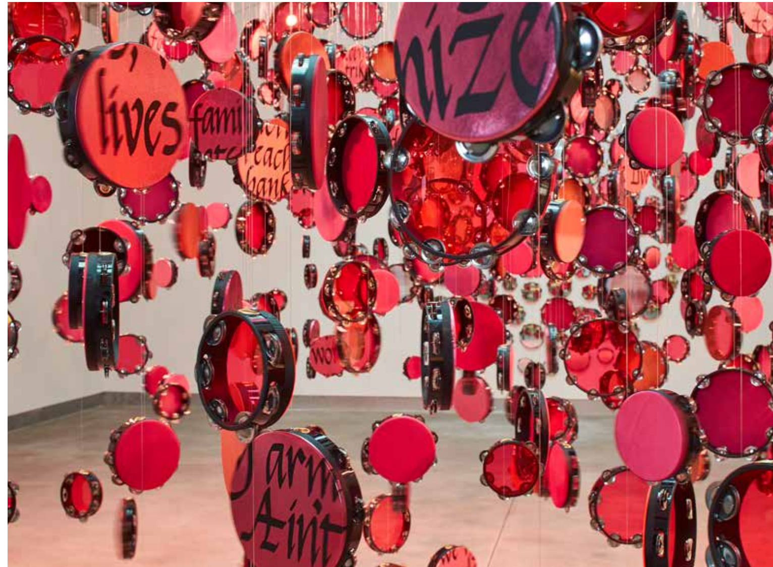
Lava Thomas, “Resistance Reverb: Movements 1 & 2”

For this collection, Eggert’s “All That is Possible is Real” neon sign flashes